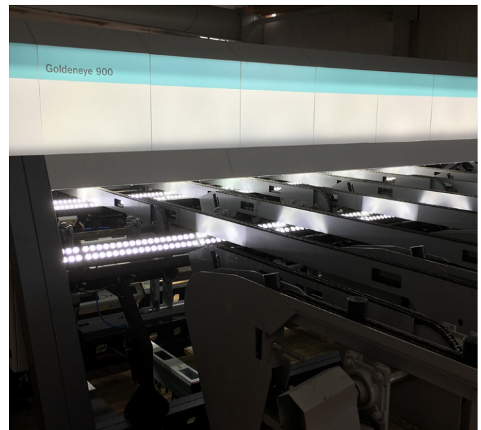
Goldeneye 900 features Multi-Sensor cameras and sensors for laser scattering, laser 3D triangulation, color analysis and X-ray scanning.